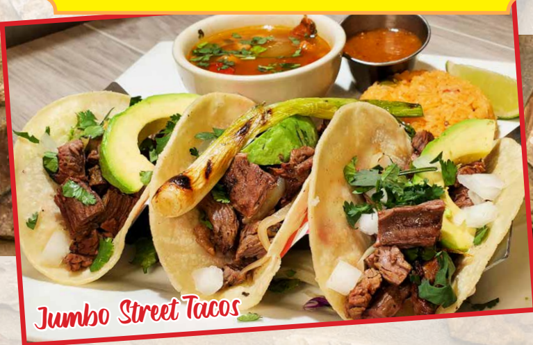
Jumbo Street Tacos

Ceviche, shrimp cocktail, guacamole, and chili con queso. $23.95