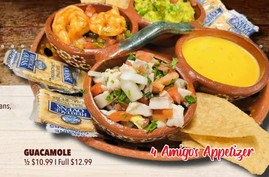
4 Amigos Appetizer

Queso dip with ground beef, guacamole & chicharrones. Side of chicharrones. $4.99