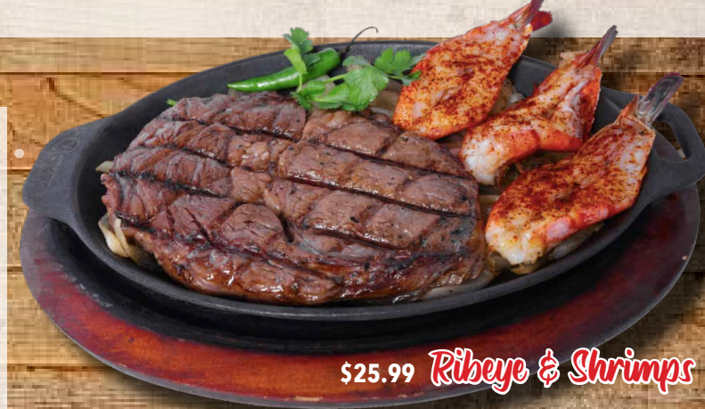
$25.99 Ribeye & Shrimps

Beef or chicken fajitas served with guacamole, pico de gallo, rice, charro beans and tortillas $14.99