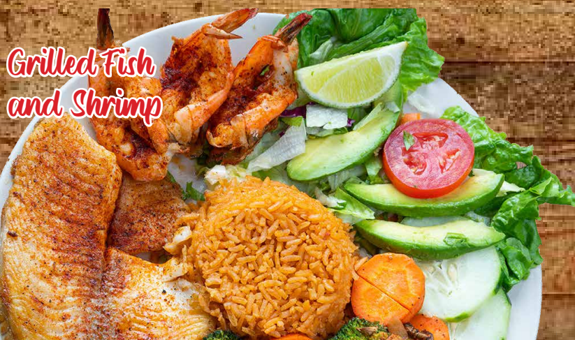
Grilled Fish and Shrimp

ADD $0.75 FOR SUBSTITUTIONS. A 15% GRATUITY WILL BE ADDED ON PARTIES OF 5, GUESTS AND MORE.